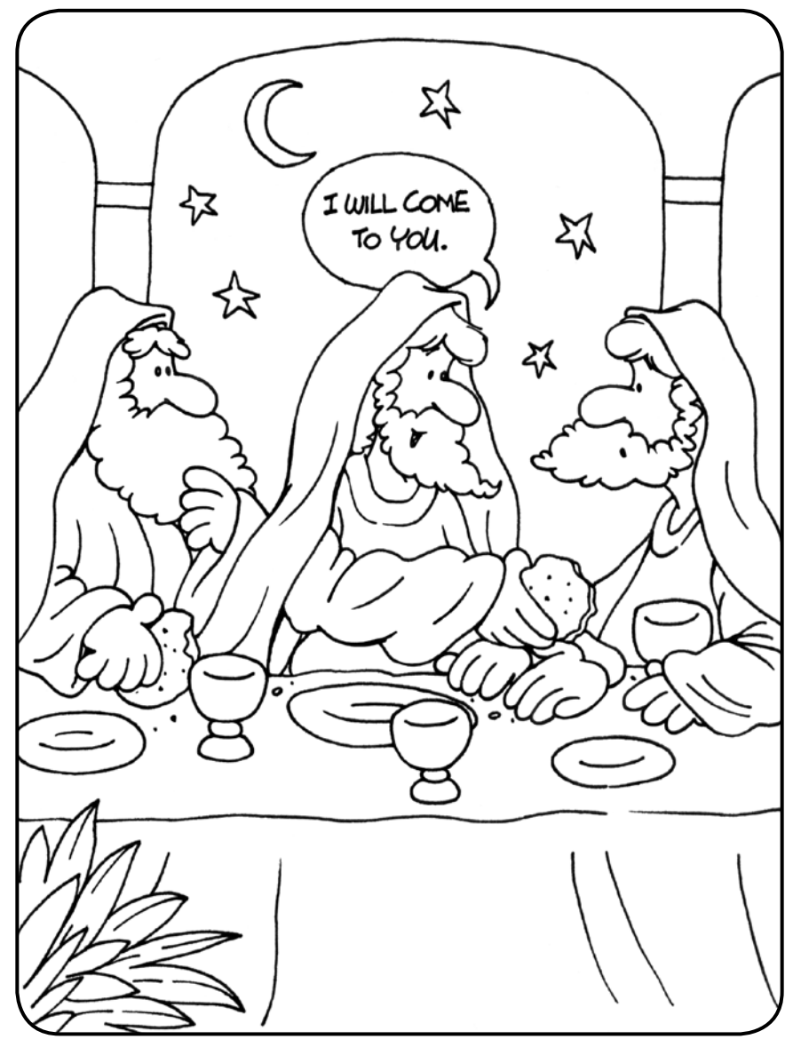
Because I live, you also will live.